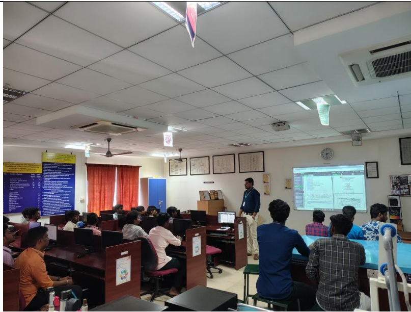
Fig. 3 Glimpses